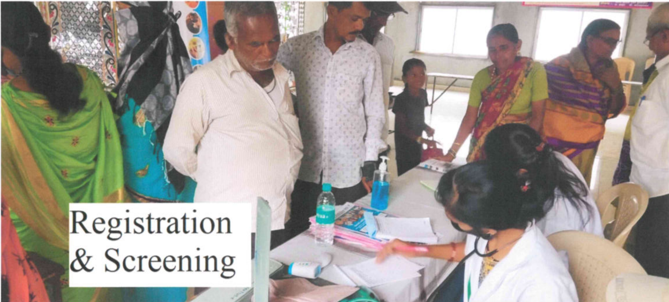
Registration & Screening